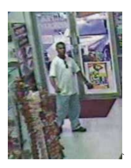
Investigative Lead #2