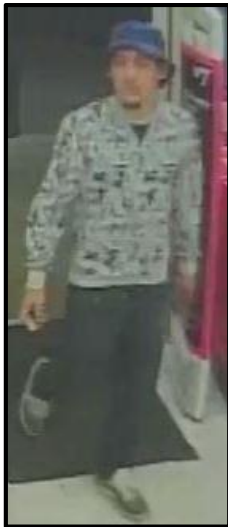
Person of Interest #1